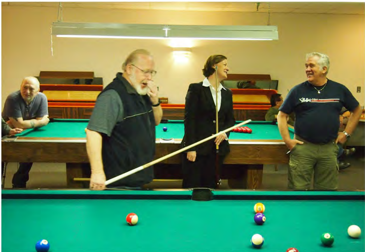
Premier Redford at Norbridge Seniors Centre - Lethbridge

“There is a choice for Albertans to make in this election. A clear difference of priorities. My priority is schools for children.” – Premier Alison Redford